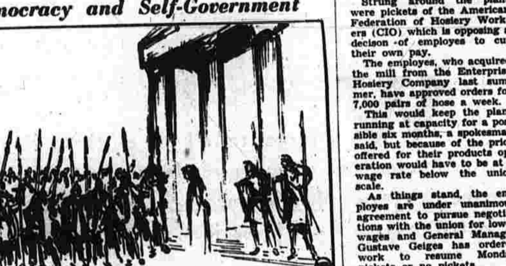
The vast difference between democracy and self-government.

By Hendrik Willem van Loon Illustrated by the author