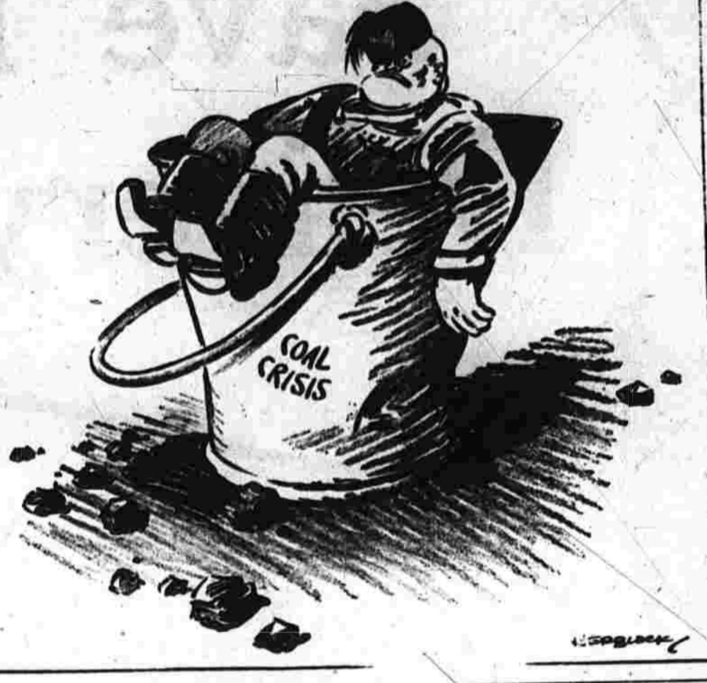
The coal crisis.

London, March 9.—Approximately 30,000 Britons registered today for the first time since the outbreak of the war.